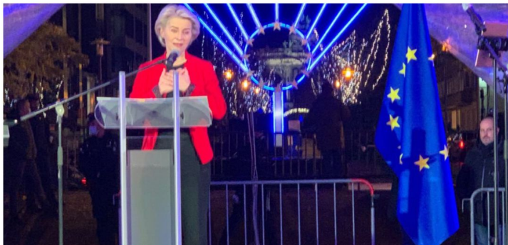
European Commission President Ursula von der Leyen spoke two years ago at the EuroChanukah event.

The theme of this year EuroChannukah lighting is