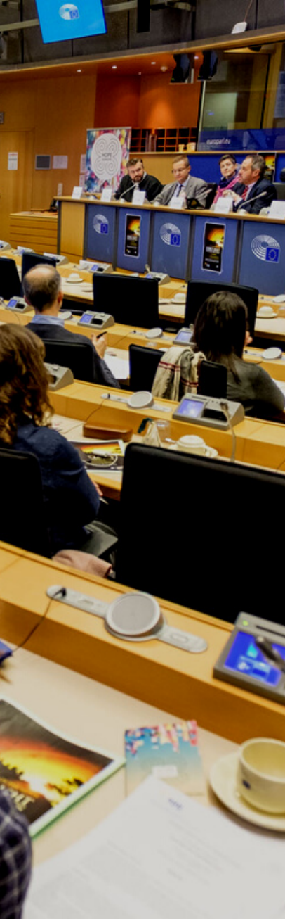
EU AFFAIRS P. 2