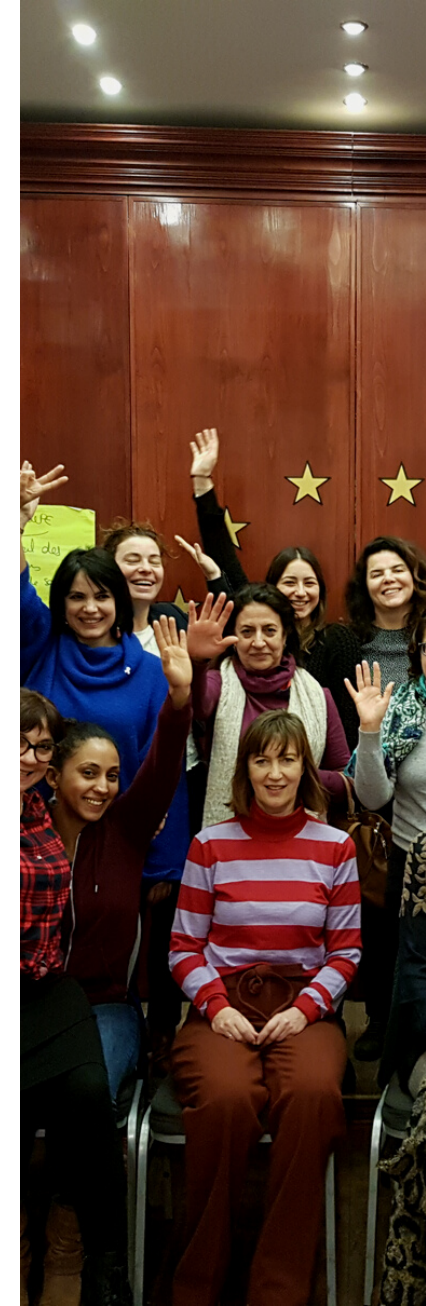
DIALOGUE & DIVERSITY P. 15