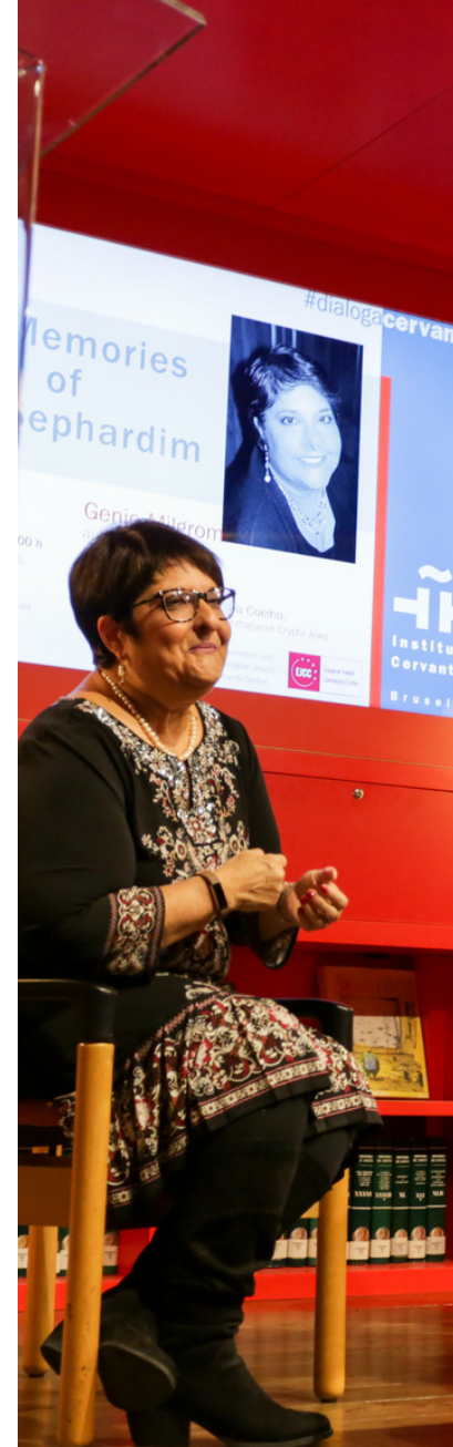
CULTURE P. 13