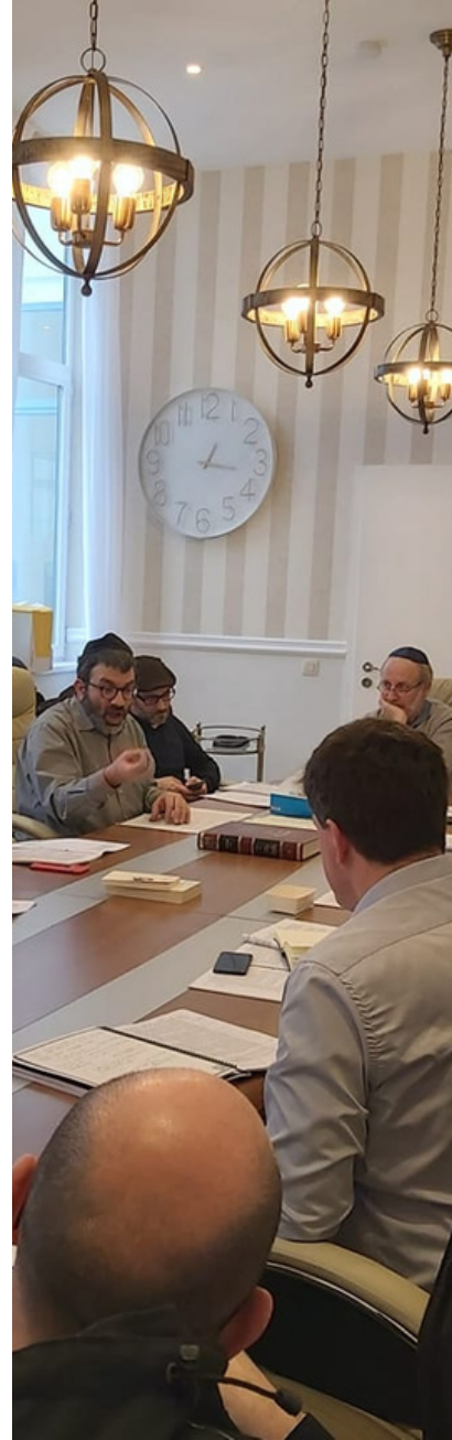
EDUCATION P. 6